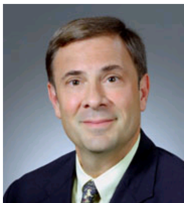
Professor of Law

Ph: 614-236-6675 | Fx: 614-236-6956 | Room: 623 | dkobil@law.capital.edu