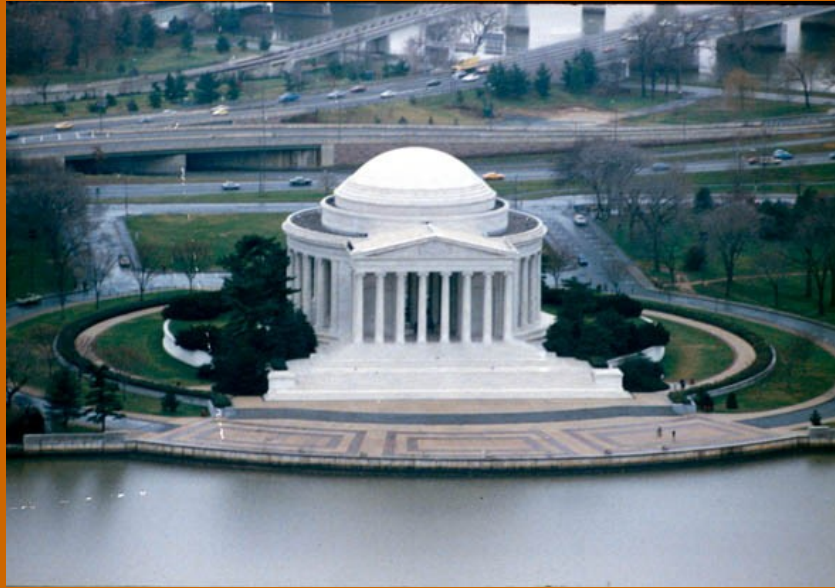
The Jefferson Memorial, Washington D. C.