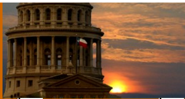
The Texas State Capitol

NOVEMBER 3, 2009 Election Day , 7 a.m.—7 p.m.