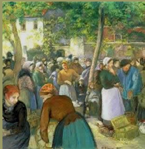
Market Place, Gisors. Camille Pissarro (1885)