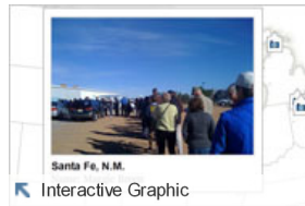
Santa Fe, N.M. Interactive Graphic