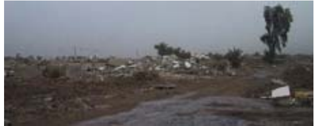
Destroyed Al Raya State Company.