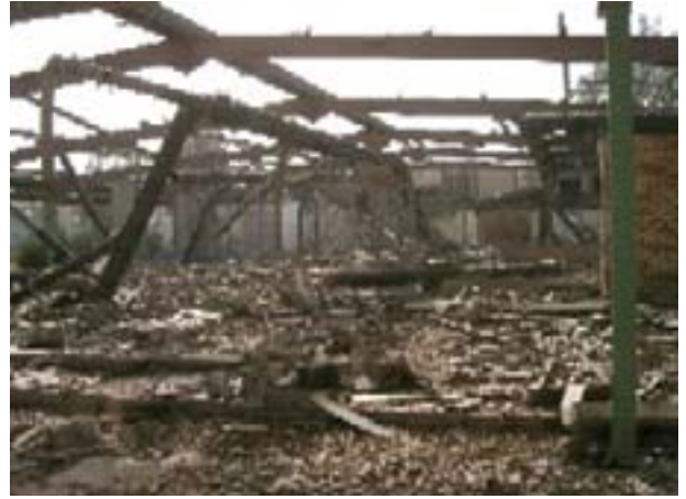
Destruction of Tuwaiitha Tools Workshop Site.