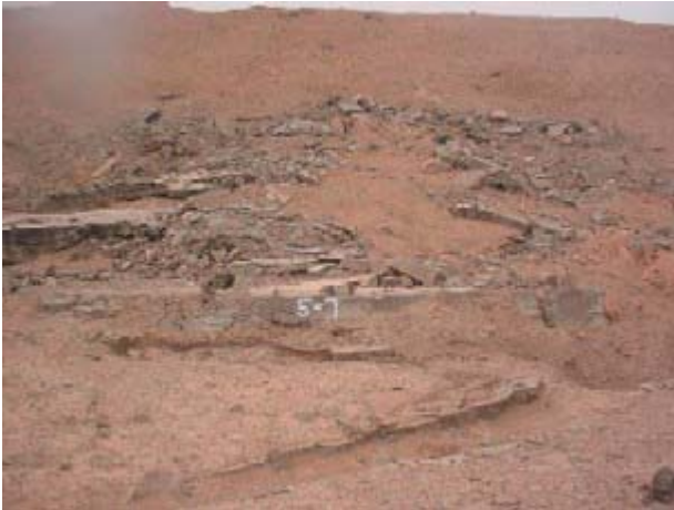
Destroyed Al Qa'qa'a bunker that, according to IAEA, contained RDX/PETN prior to OIF.