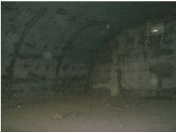
Intact, empty former HMX bunker at Al Qa'qa'a.