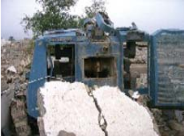
Al Raya State Company—damaged and looted Arcardini CMM camera-monitored by IAEA.