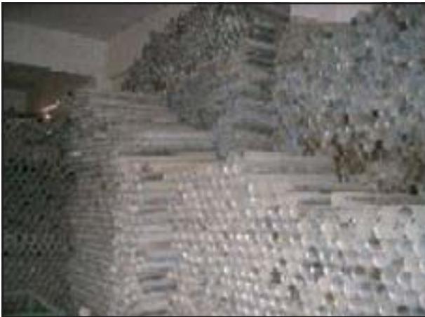
81-mm aluminum tubes in a Dhu al-Fiqr Factory warehouse.