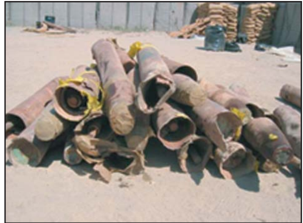
Sakr 18 Rockets