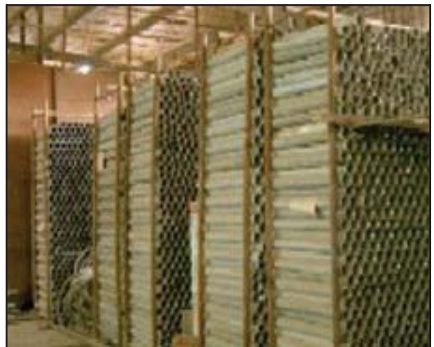
81-mm aluminum tubes in a second Dhu al-Fiqr Factory warehouse.

pieces might have been disassembled for valuable subassemblies such as motors and condensers. Still others could have been taken intact to preserve their function.