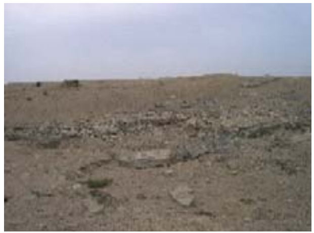
Destroyed former HMX bunker at Al Qa'qa'a.